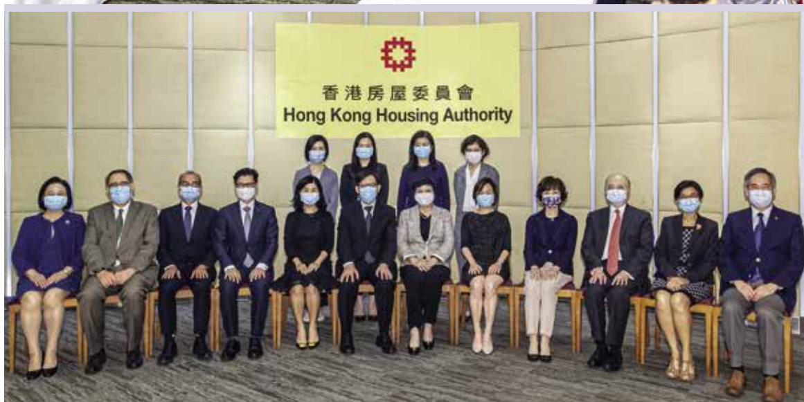
Visit to the Housing Department on 4 November 2020