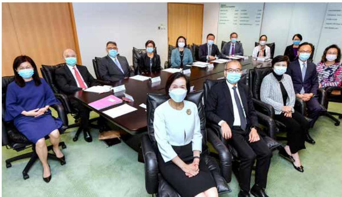
The Public Service Commission at a meeting.